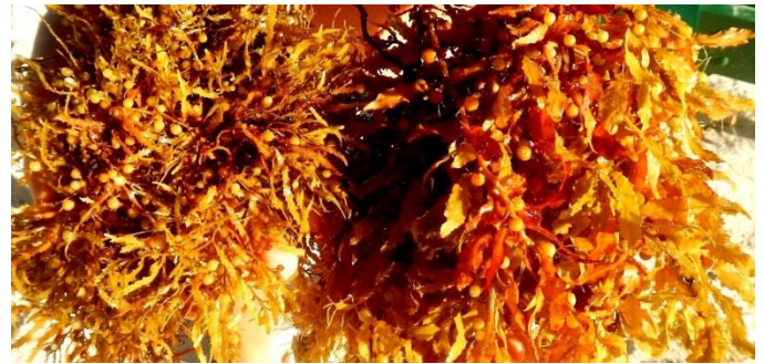
Left: Sargassum natans ; Right: Sargassum fluitans

What is it? Pelagic sargassum is a brown alga, or seaweed that floats free in the ocean and never attaches to the ocean floor. These free-floating forms are only found in the Atlantic Ocean. Sargassum provides refuge for migratory species and essential habitat for some 120 species of fish and more than 120 species of invertebrates. It's an important nursery habitat that provides shelter and food for endangered species such as sea turtles and for commercially important species of fish such as tunas. There are two species of sargassum involved in the sargassum influx: Sargassum natans and Sargassum fluitans .