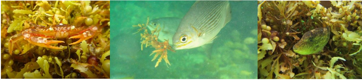
Sargassum life

What are some good practices to apply if removing sargassum from beaches? A review of experiences from beaches affected by sargassum in the Gulf of Mexico at the 2015 Sargassum Symposium hosted by Texas A&M University Galveston Campus, NASA Stennis Space Center and Galveston Island Park Board of Trustees highlighted that: