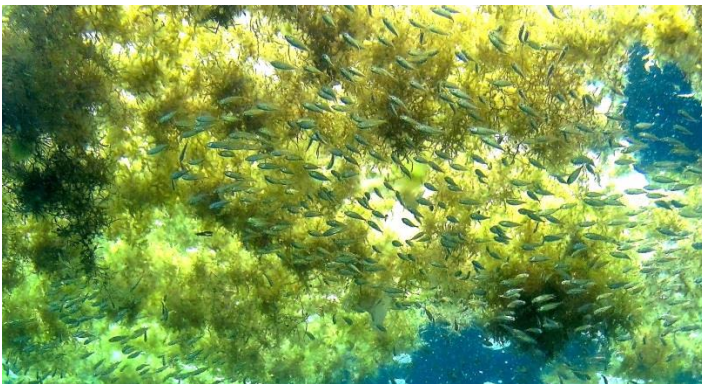
The sargassum ecosystem

Where does it come from? Sargassum travels on ocean currents. Scientists are able to determine where the sargassum comes from by back-tracking from its stranding location using ocean models and data on movements of satellite trackers that are deployed at sea. It is believed that the recent influxes are related to massive sargassum blooms occurring in particular areas of the Atlantic, not directly associated with the Sargasso Sea, where nutrients are available and temperatures are high. The sargassum consolidates into large mats and windrows and is transported by ocean currents towards and throughout the Caribbean.